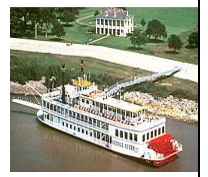
Creole Queen Paddlewheeler

MAKE YOUR RESERVATIONS TODAY! To Guarantee Hotel Accommodations and Banquet Seating