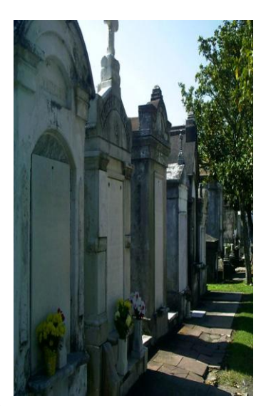
New Orleans Above Ground Cemetery